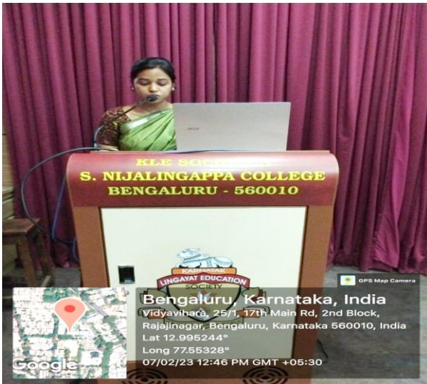
Master of Ceremony