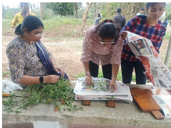
Preparation of Herbarium Collected the Plants from Western ghats on Botanical Tour