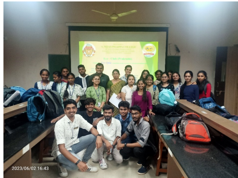
Conducted Eco-Quiz Competition On Environmental Day