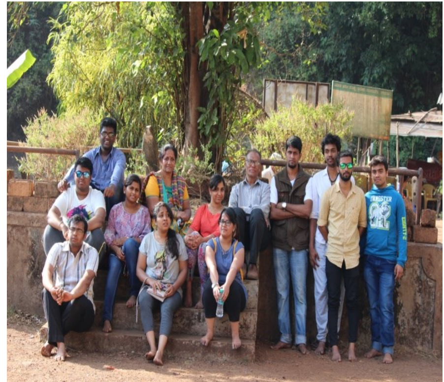
Field Visit to Dandeli-Yana-Kodachadri ,2017