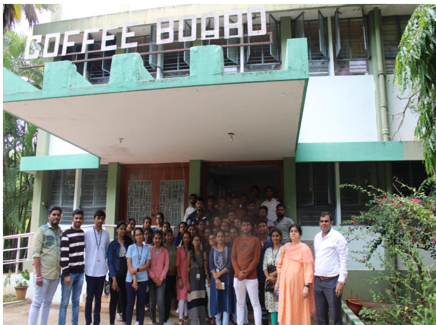
Visit to CCRI (Coffee Board), Mysore, 2023