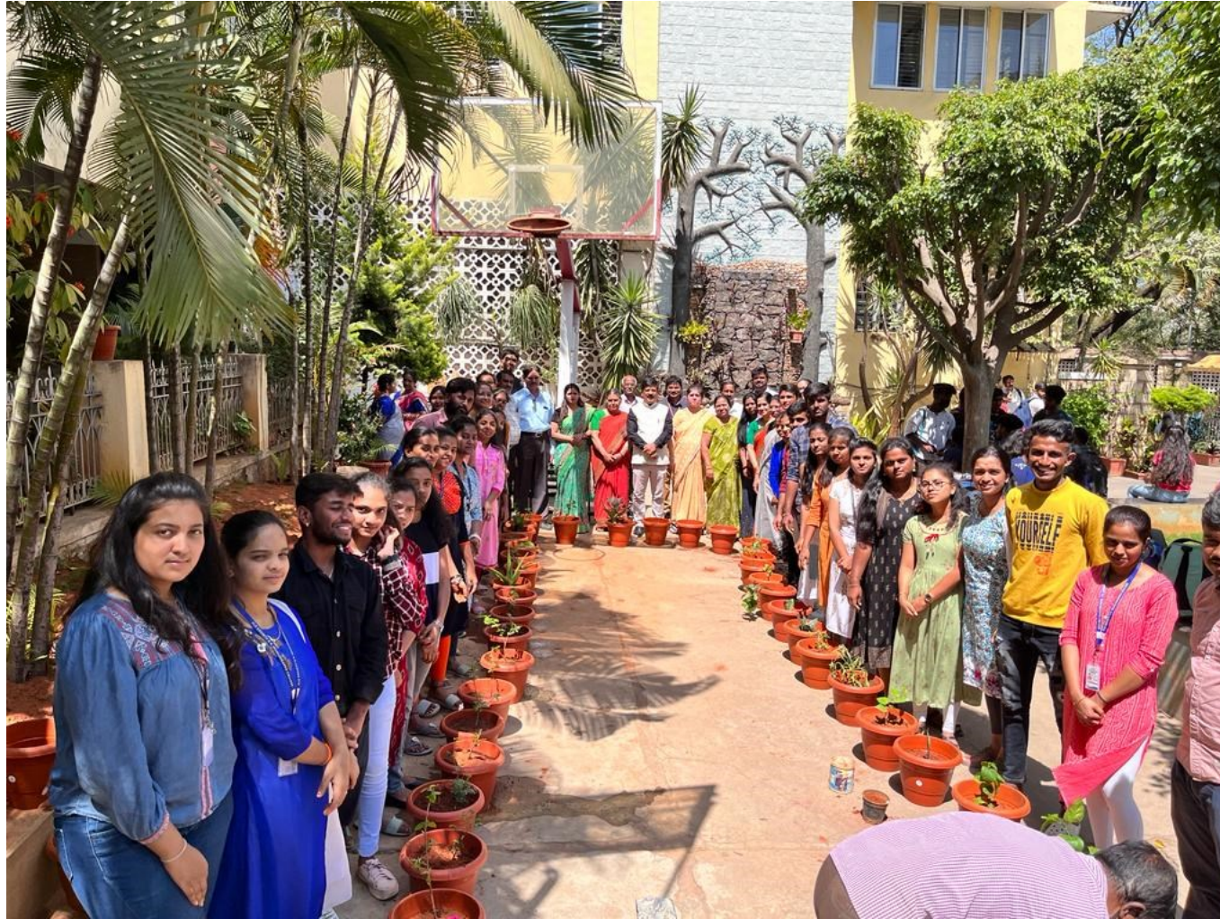
Plant Adoption Programme, 2023