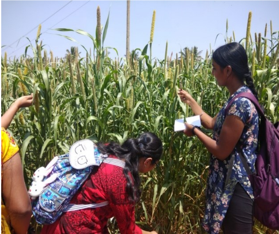
Botany Students are collecting pathology specimens at GKVK, 2019