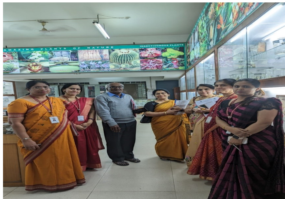
AAA Committee Visit to the Department