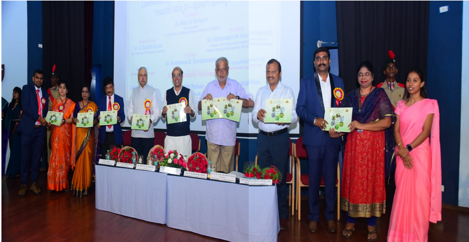
Launch of Campus Flora KLESNC, 2023