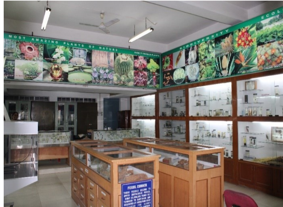
Well Equipped Laboratory and State of Art Museum having 1419 Specimen