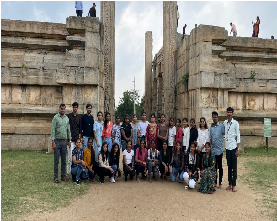
Students Visited Melukote to study Vegetation