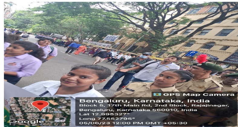
Rally on Environmental Day-2023