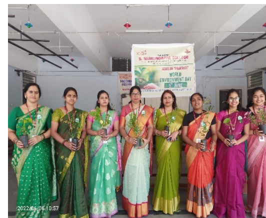
Distribution of Plants on World Environment day 2022