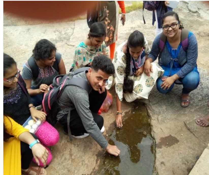
Students are collecting algal specimens at Lal bagh 2018