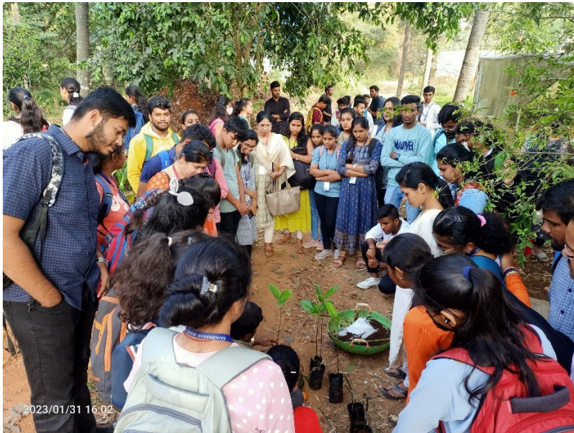
Hands on training on Vegetative Propagation At Bio-centre, Hulimavu-2022