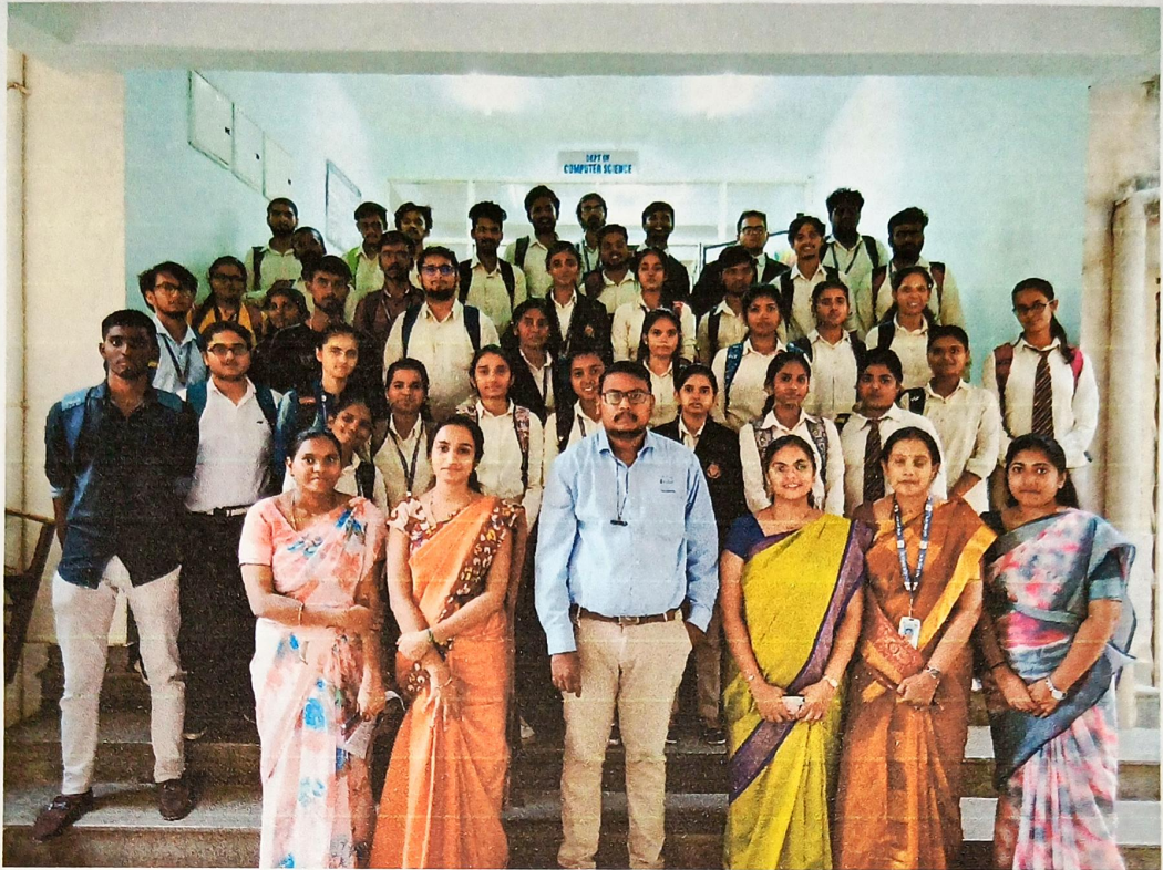
38 students got shortlisted at the end of 3 rounds. Photo with all shortlisted candidates and with all the enablers