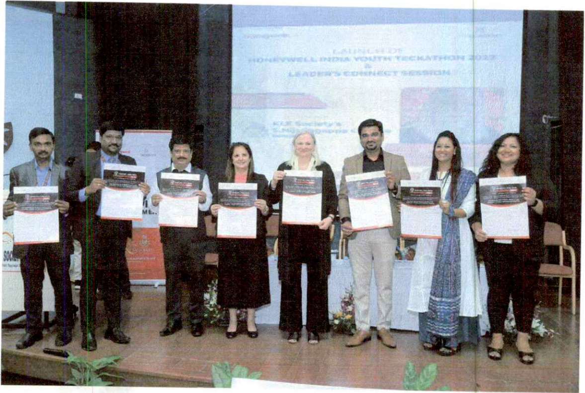
5. The launching of Honeywell India Youth Teckathon 2022.