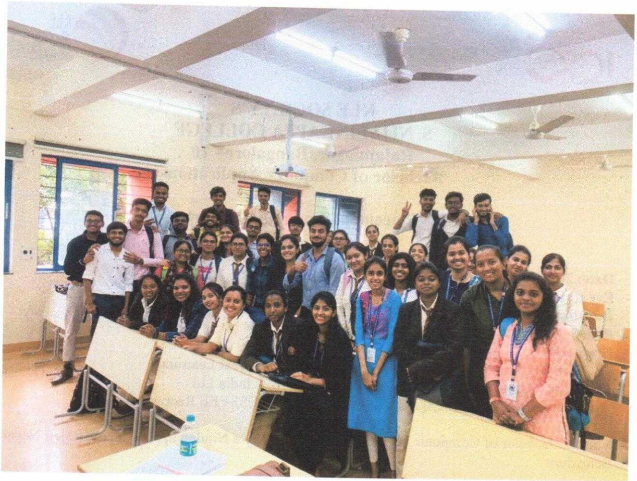
(Final Happy Faces of the students who completed all the sessions trained by the trainers)

The sessions handled by all three trainers made our students understand their core value of communication, interaction at an easy way and mainly the independent yet productive ways to professionally communicate with each other.