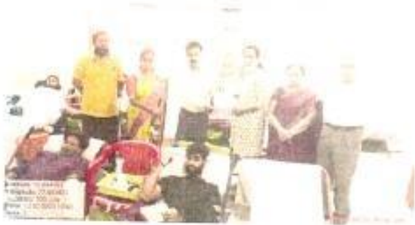
Principal is appreciating blood donor.