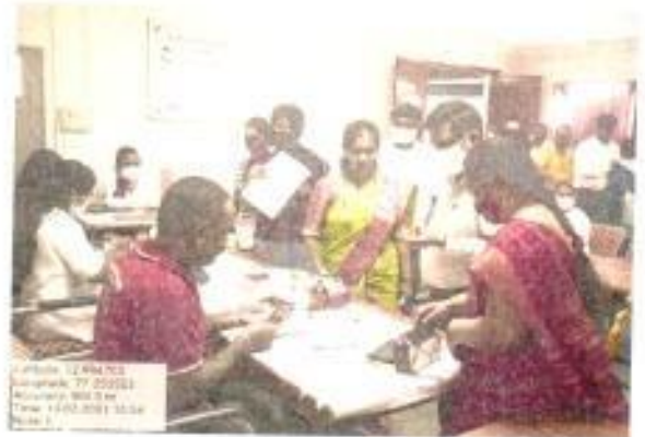
Principal is getting testing blood group