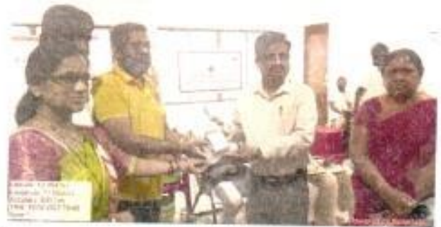
Handing over blood sacket to the Lions Club member