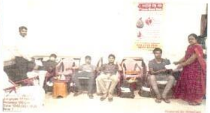
Blood pressure checking and distribution of certificates to the blood donors

Twardi Youth Red Cross Programme Officer KLE's S. Nijalingappa College II Block, Rajajinagar, Bengaluru-560 010