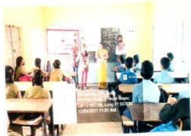
YRC Program officer delivering a talk