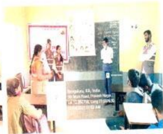
Feedback and interaction with student