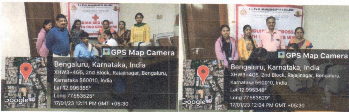
Vaccination for students

OUT COME: 44 Faculty & Students received advantage of vaccination drive.