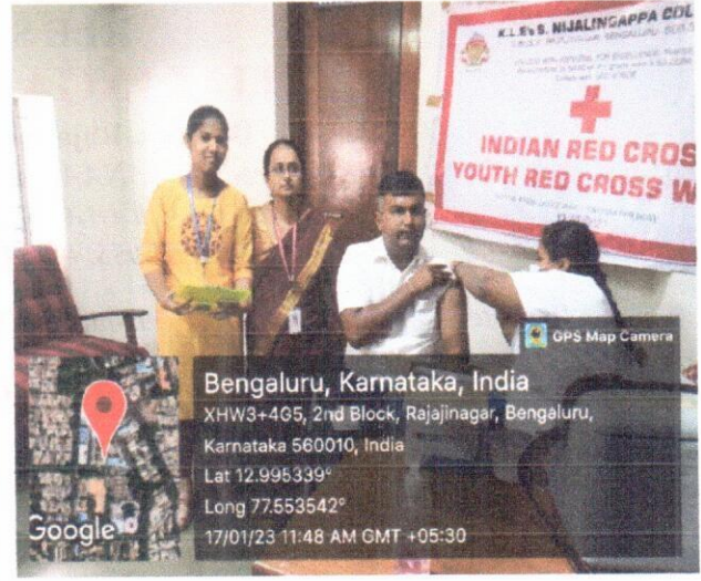
Bengaluru, Karnataka, India XHW3+4G5, 2nd Block, Rajajinagar, Bengaluru, Karnataka 560010, India Lat 12.995339° Long 77.553542° 17/01/23 11:48 AM GMT +05:30