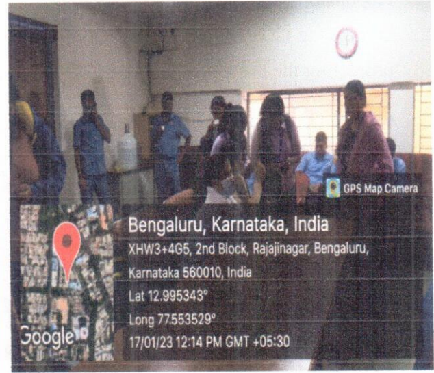
Bengaluru, Karnataka, India XHW3+4G5, 2nd Block, Rajajinagar, Bengaluru, Karnataka 560010, India Lat 12.995343° Long 77.553529° 17/01/23 12:14 PM GMT +05:30