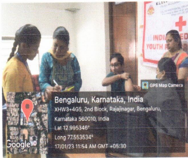
Bengaluru, Karnataka, India XHW3+4G5, 2nd Block, Rajajinagar, Bengaluru, Karnataka 560010, India Lat 12.995346° Long 77.553534° 17/01/23 11:54 AM GMT +05:30