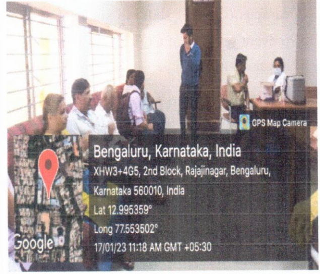
Bengaluru, Karnataka, India XHW3+4G5, 2nd Block, Rajajinagar, Bengaluru, Karnataka 560010, India Lat 12.995359° Long 77.553502° 17/01/23 11:18 AM GMT +05:30