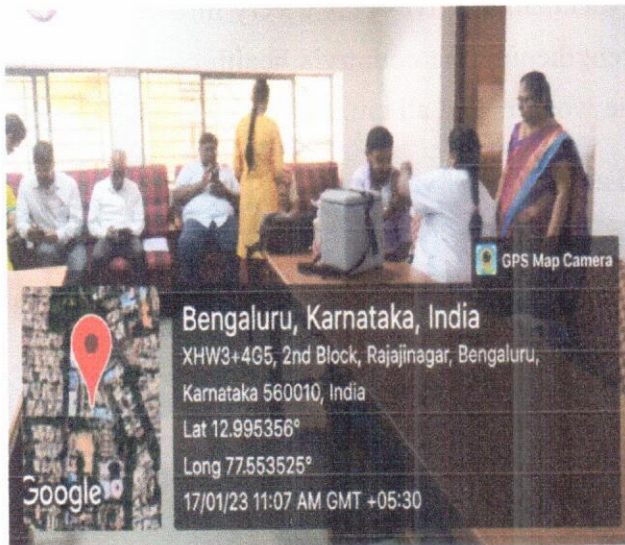
Bengaluru, Karnataka, India XHW3+4G5, 2nd Block, Rajajinagar, Bengaluru, Karnataka 560010, India Lat 12.995356° Long 77.553525° 17/01/23 11:07 AM GMT +05:30