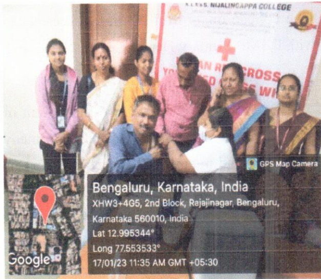
Bengaluru, Karnataka, India XHW3+4G5, 2nd Block, Rajajinagar, Bengaluru, Karnataka 560010, India Lat 12.995344° Long 77.553533° 17/01/23 11:35 AM GMT +05:30