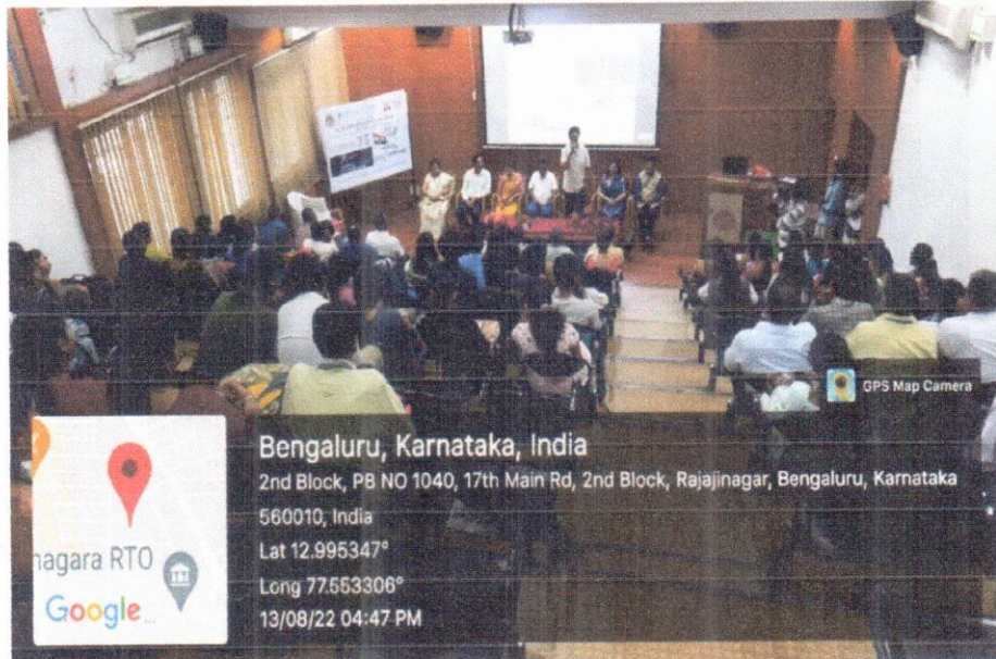
Interactive workshop on Amuthmahotsava.