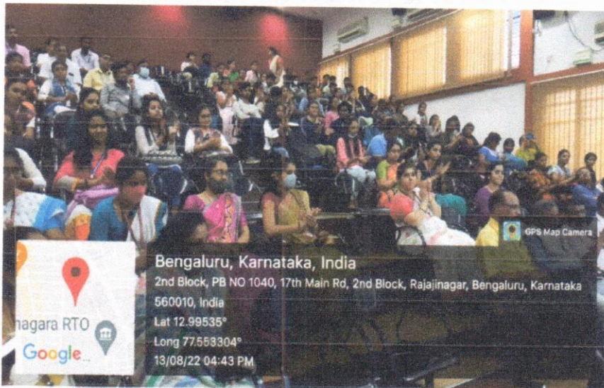
Audience gathering in Amruthamahotsava