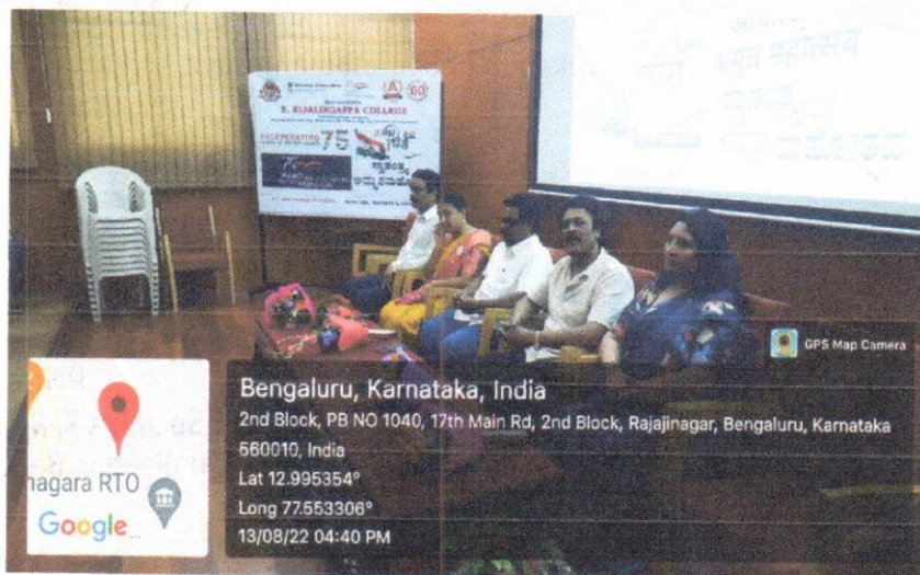
Chief guests in Amruthamahotsava