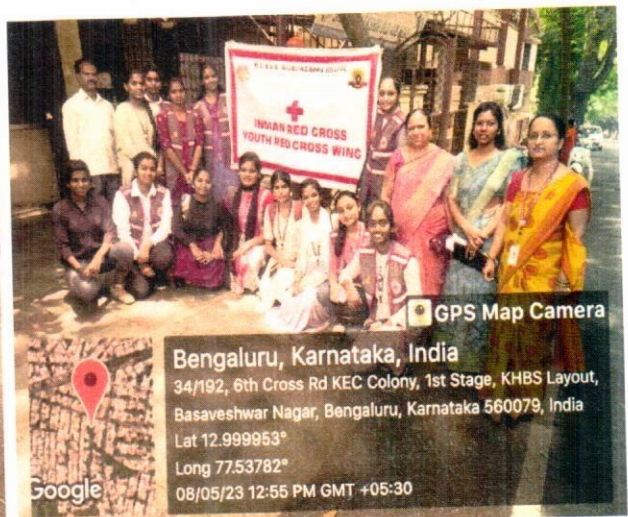
Group photo after completion of Programme

Twandi Youth Red Cross Programme Officer KLE's S. Nijalingappa College II Block, Rajajinagar, Bengaluru-560 010