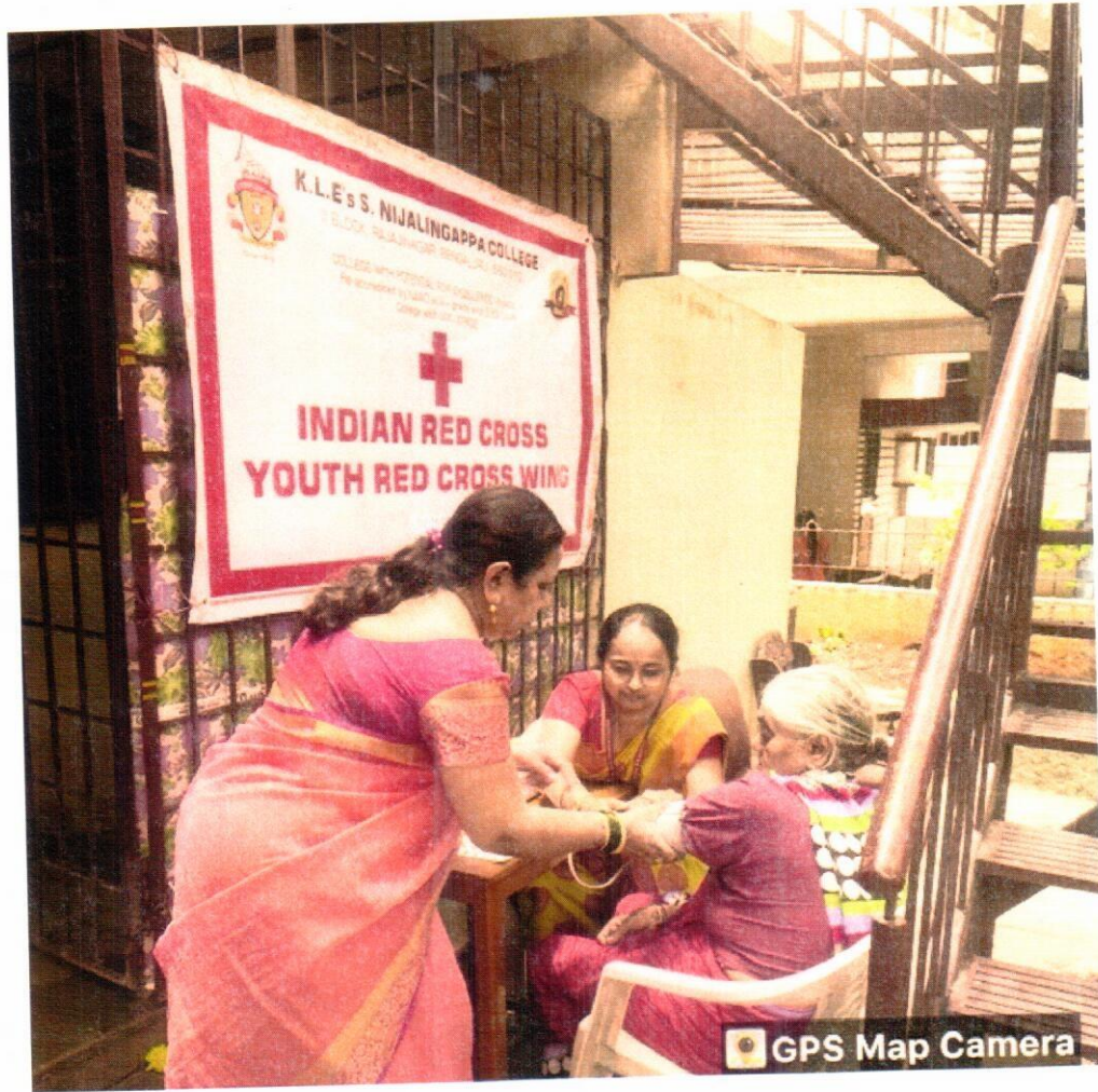
Blood pressure check-up by Youth Red Cross Programme Officer and Co-Programme Officer