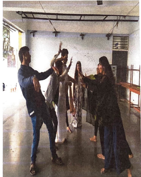
Students performing skits "Swachhateya Andolana"

Head of the English Department KLE Society's S. Nijalingappa College Rajajinagar, Bengaluru-560 010