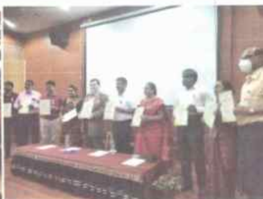
Released National e- Conference proceedings