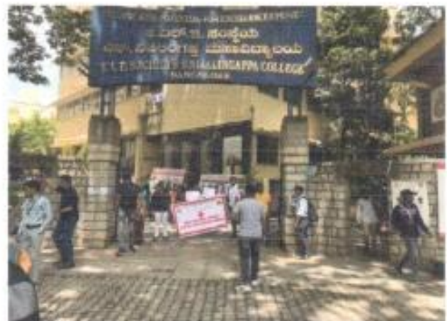
RALLY STARTED FROM OUR COLLEGE