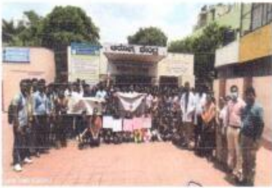
STUDENTS & STAFF AT PHC