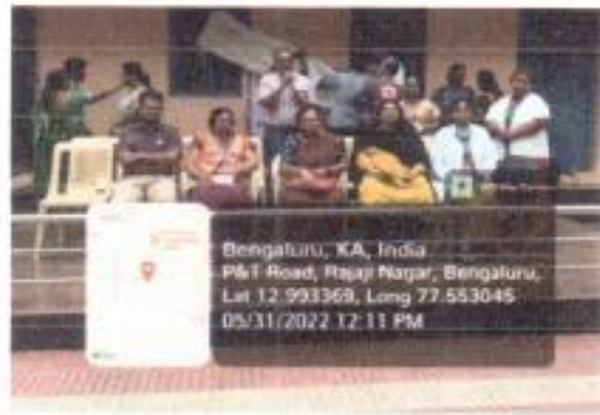
RALLY PROGRAM IN GOVT SCHOOL