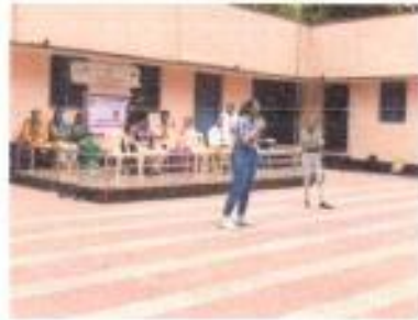
OUR STUDENTS TALKING ABOUT TOBACCO AWARENESS