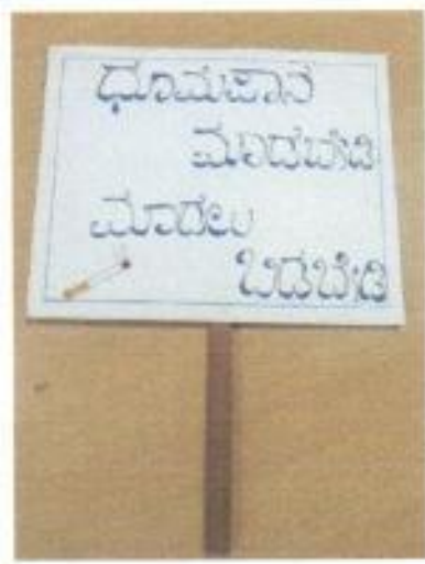
PLAYCARDS FOR CREATING AWARENESS ON TOBACCO

TWandi Youth Red Cross Programme Officer KLE's S. Nijalingappa College II Block, Rajajinagar, Bengaluru-560 010