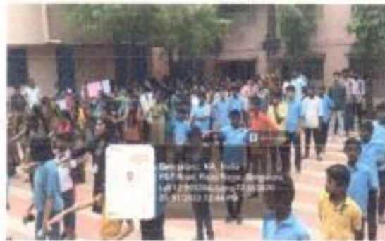
STUDENTS TAKING OATH ON NO TOBACCO DAY