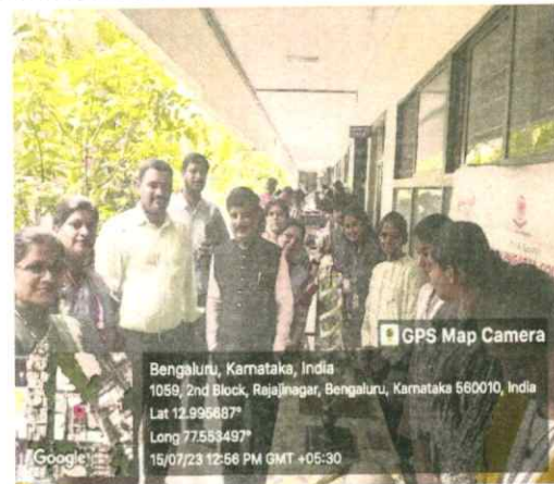
Principal along with judge