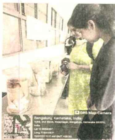
Audience observing foetuses