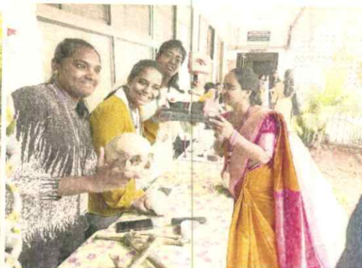
Faculty guiding the student