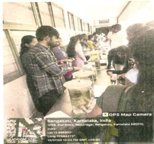
Students explaining to audience