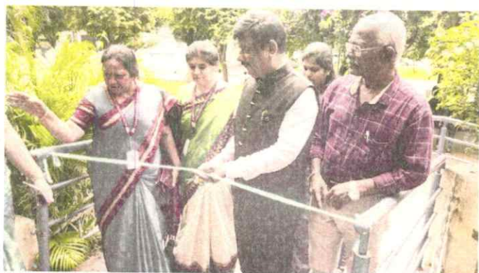
Inauguration of science exhibition

Created awareness about roll of butterflies, globe fish and also obesity and blood grouping among students of various streams of our college.