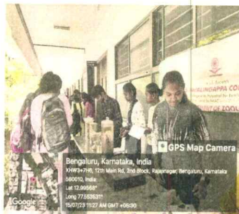
Students explaining the exhibits