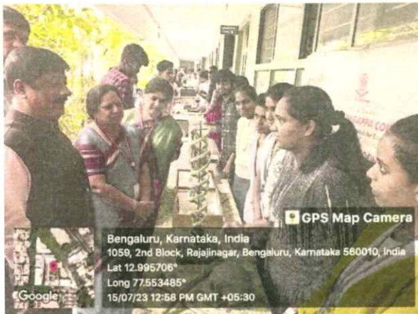
Principal providing extra information to the students.