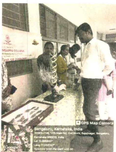
Faculty observing the Exhibition