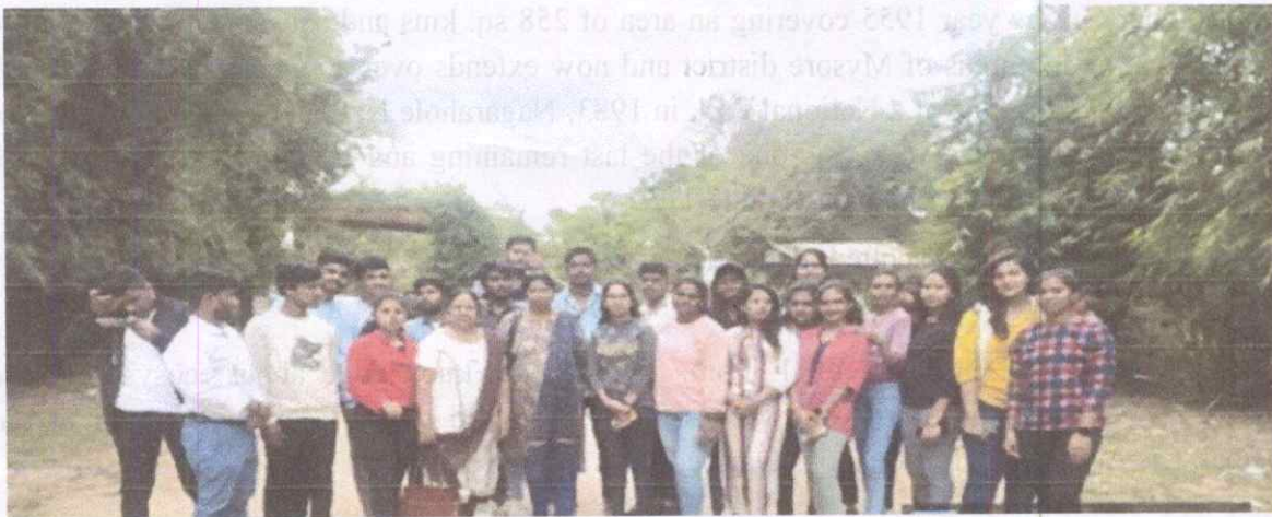
Group photo of CBZ