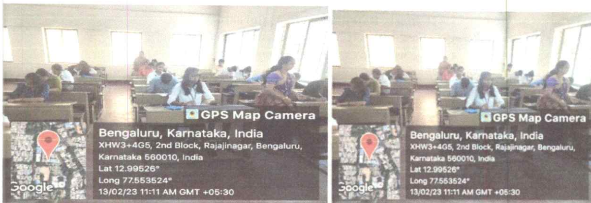
Students writing essay