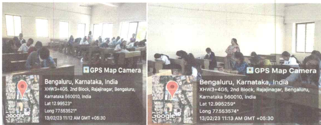
Students writing essay