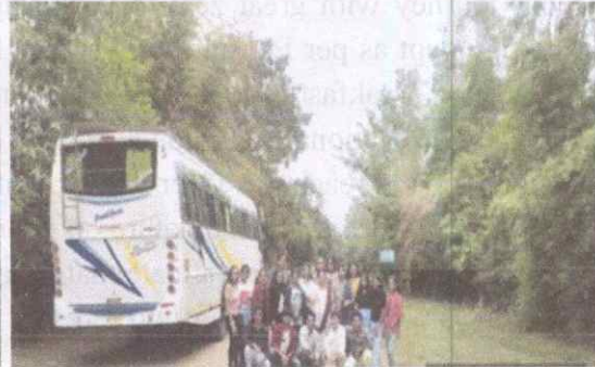
Group photo of CZBt